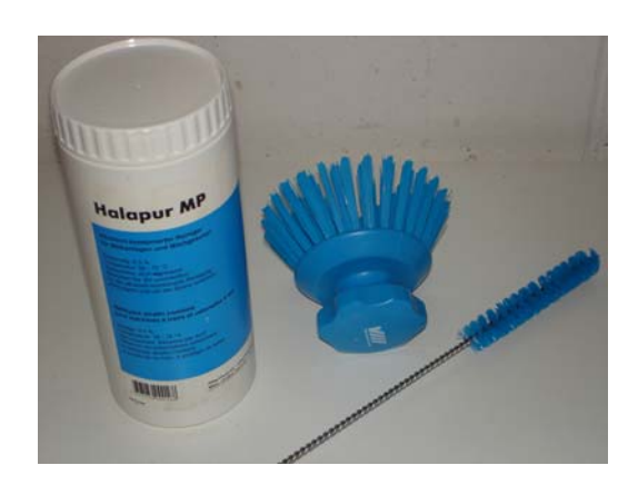
1 kg Halapur 1 pipe-brush for pump inlet pipe and outlet pipe. 1 cask- and pan-brush